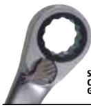
SET 605301 CONTAINS REVERSIBLE GEAR WRENCHES